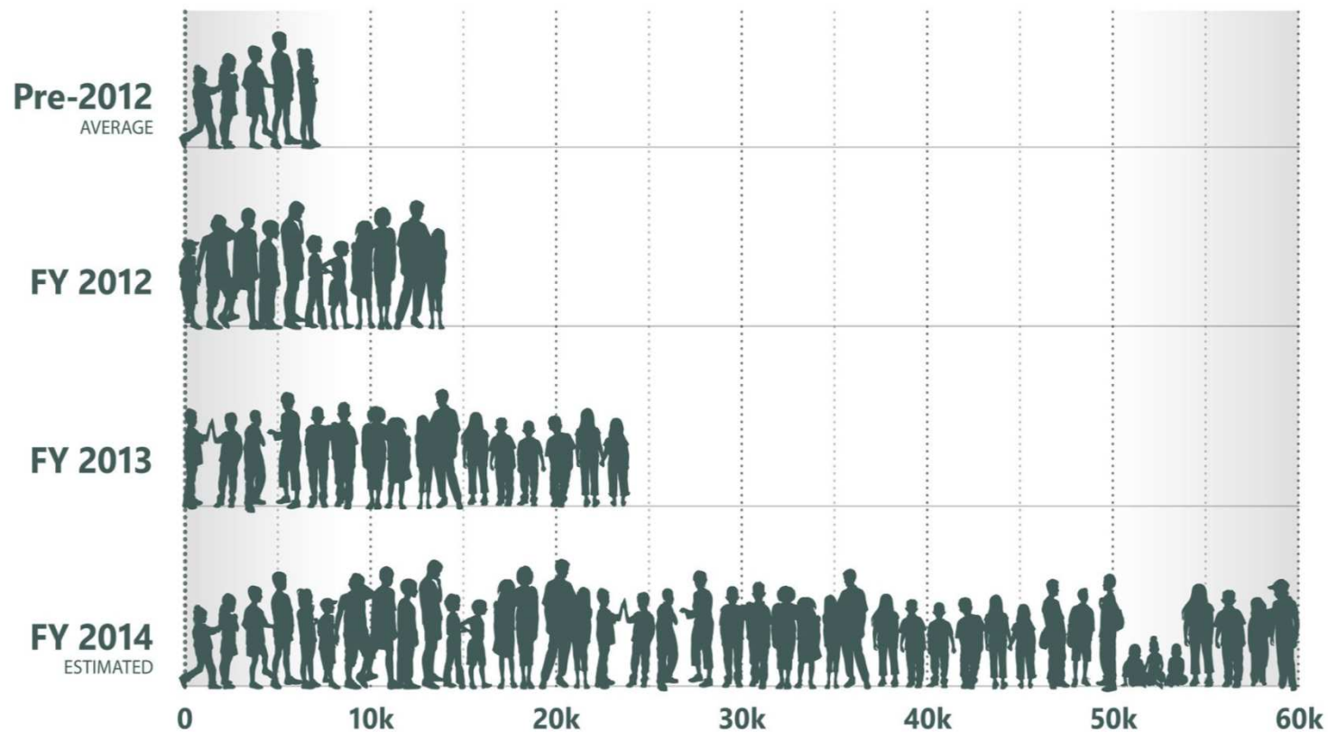
FIGURE 1: Influx of Unaccompanied Children into the United States