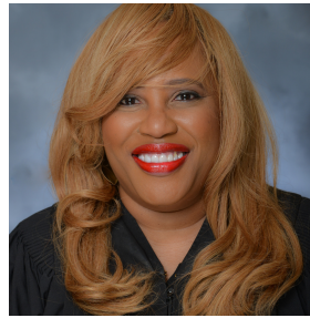
Hon. Patrice M. Ball-Reed Circuit Court of Cook County