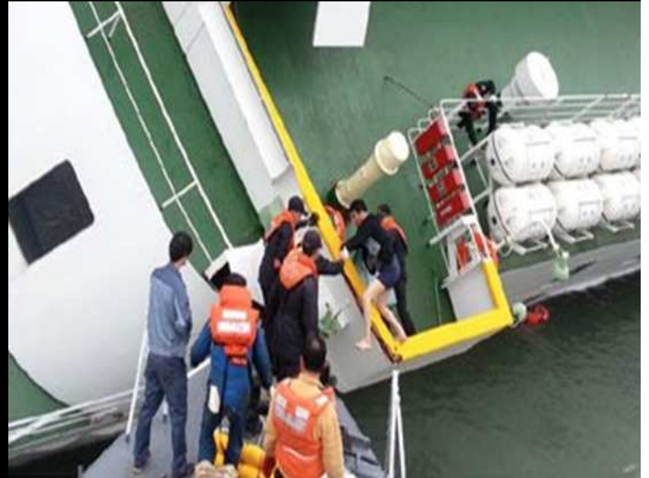
The captain being rescued