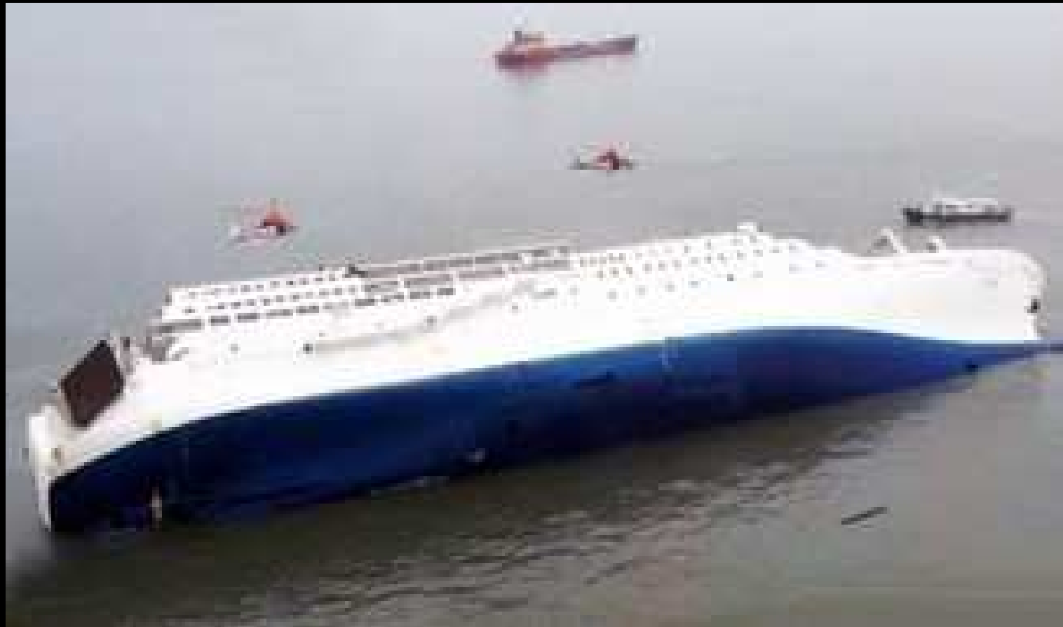
The capsizing ferry