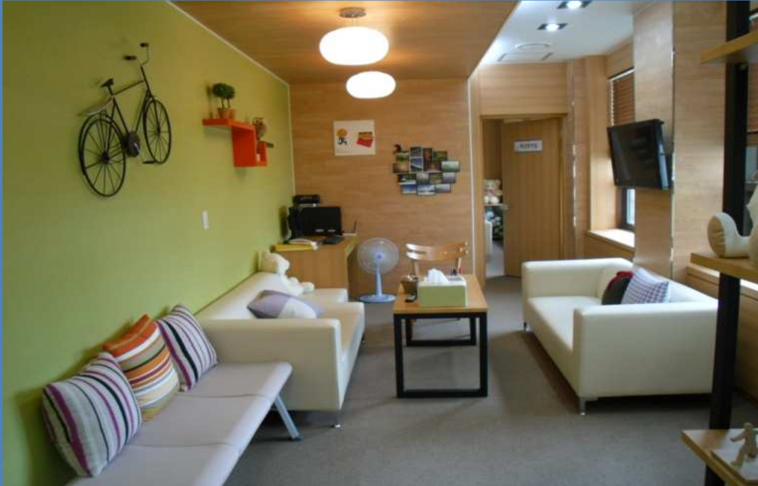
rest area for witness