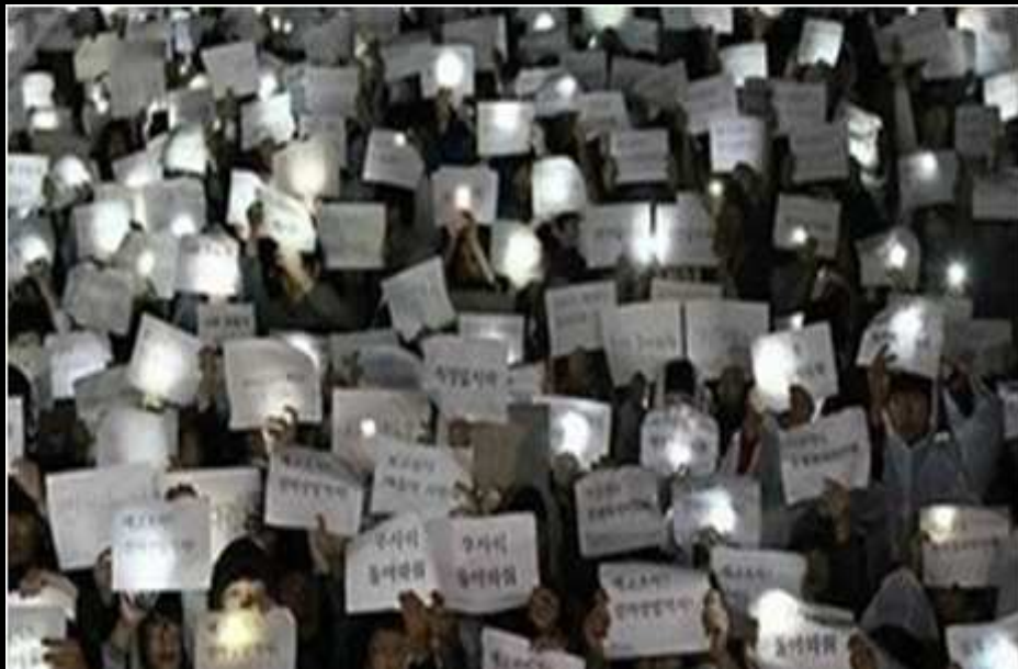
Prayers of the citizens