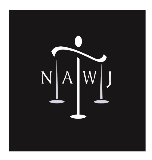
NATIONAL ASSOCIATION of WOMEN JUDGES