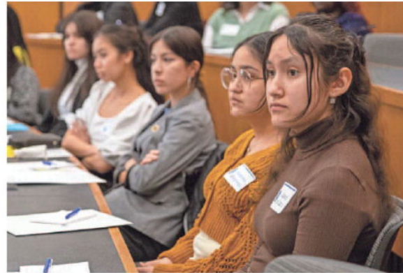
High school students from Des Moines Public Schools listen as four Drake University law students share their experiences during a panel event Tuesday.