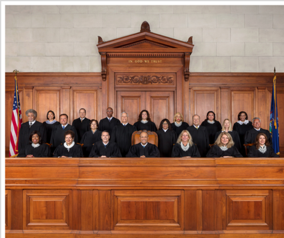
Bench photo - 2022