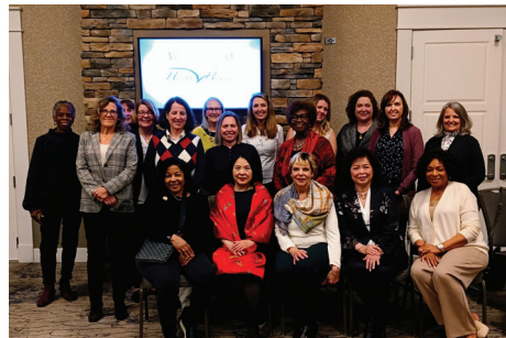
NAWJ-NY Chapter Members

Speakers included Hon. Edwina G. Mendelson, Deputy Chief Administrative Judge for Justice Initiatives, who gave a presentation about the 5 divisions of the Office for Justice Initiatives; implementation of the Equal Justice in Courts Initiative; the Judicial Committee on Wom-