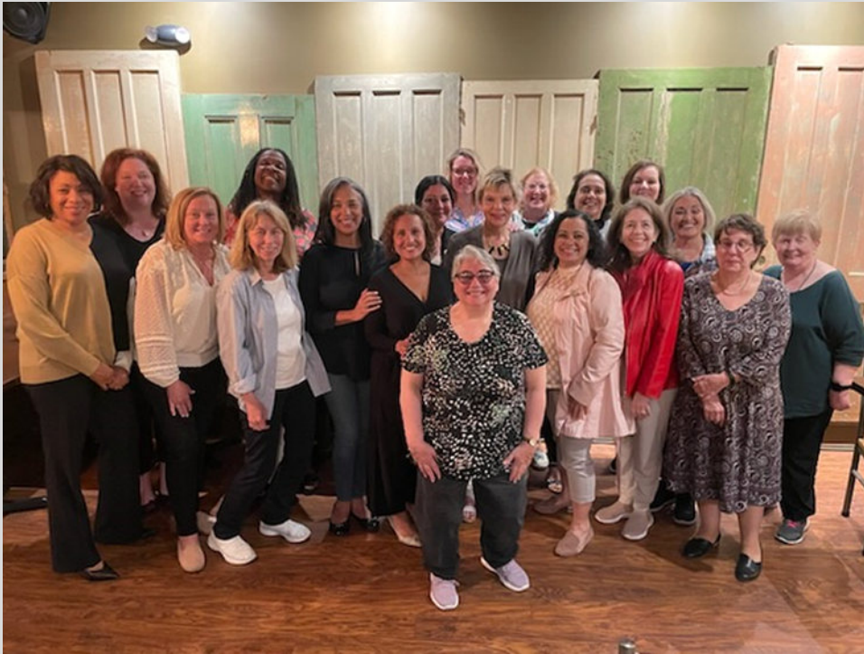
Members at Boca Bistro