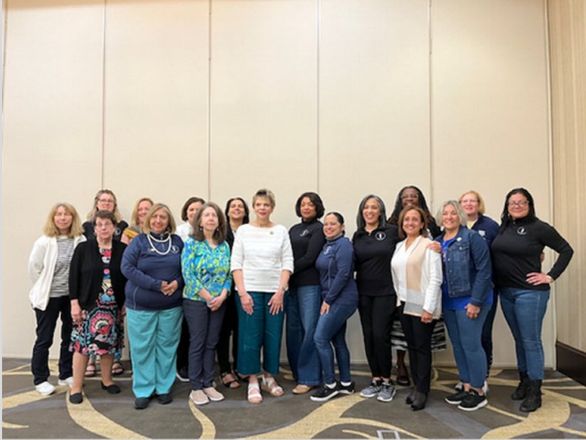
Sisters-in-Law during the spring retreat

"WOMEN WHO WOULDN'T TAKE 'NO' FOR AN ANSWER" MAY 7-9, 2023