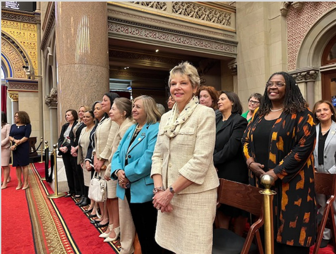
The NAWJ-NY being honored at the floor of the NY Assembly