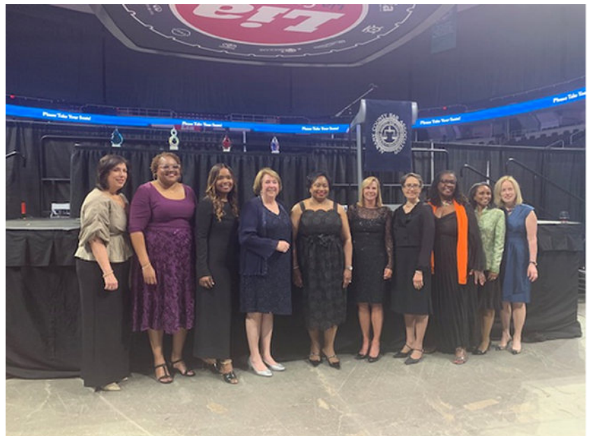
Attendees of the Court of Appeals Dinner