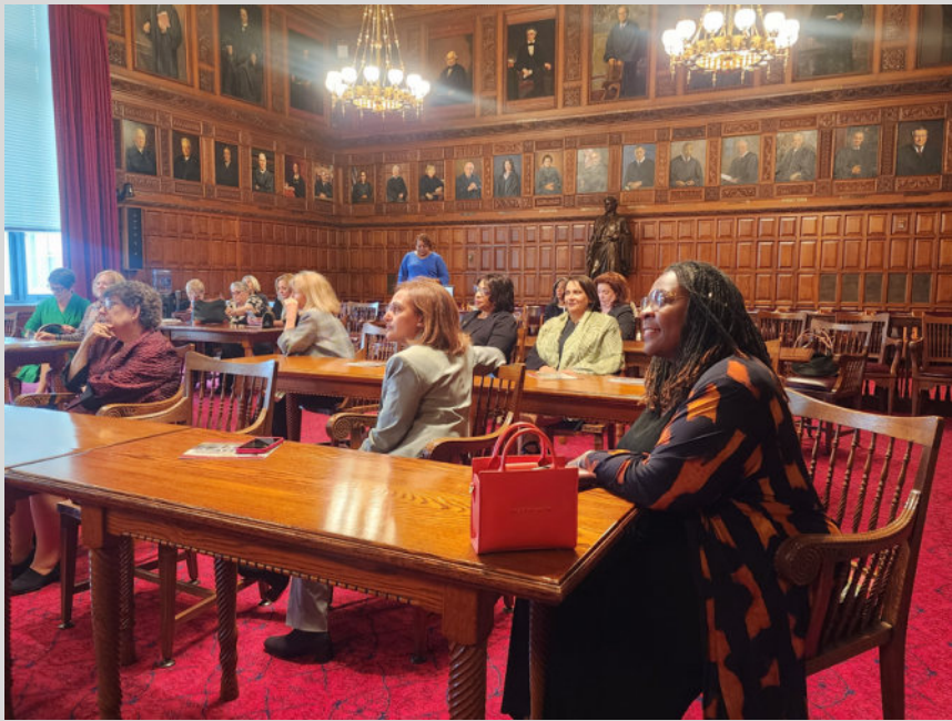
NAWJ-NY during the Court of Appeals tour