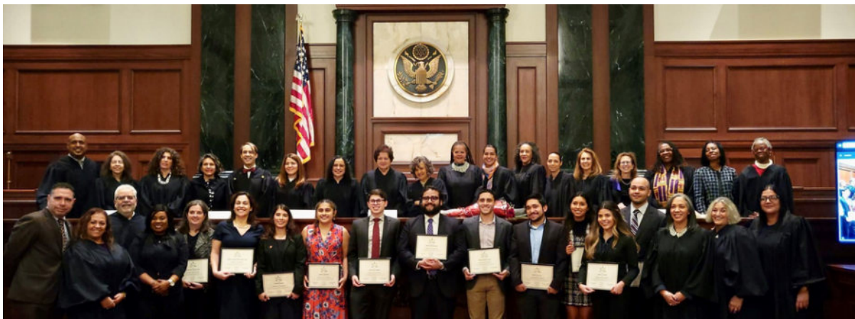
Members of the Judiciary and law students at the Southern District of New York Courthouse for the Reenactment of Mendez v Westminster sponsored by the Latino Judges Association on March 23, 2023.