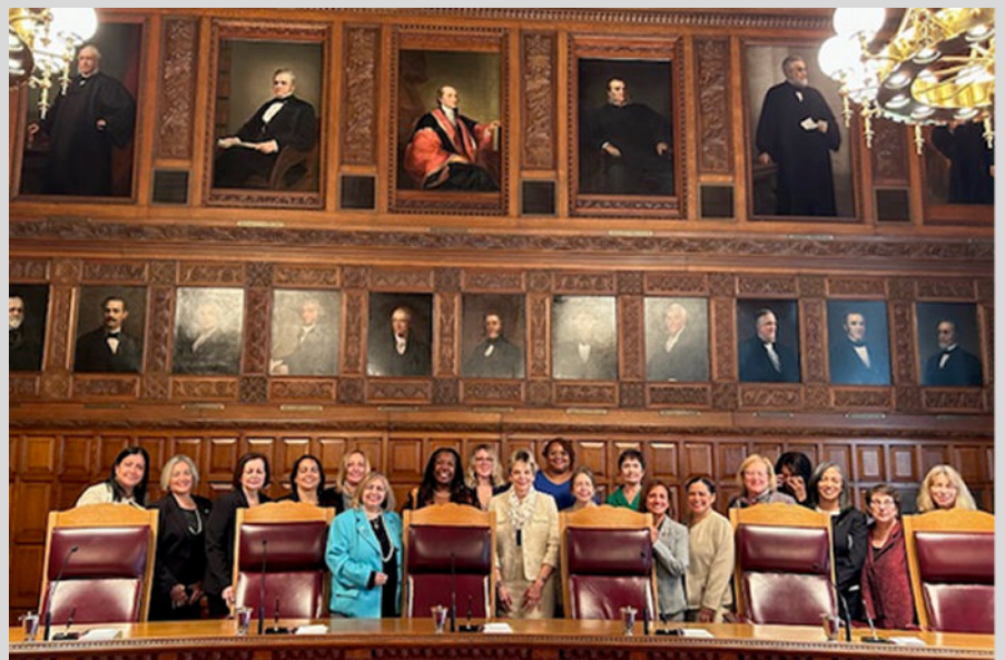
Sisters-in-Law in the Court of Appeals Courtroom