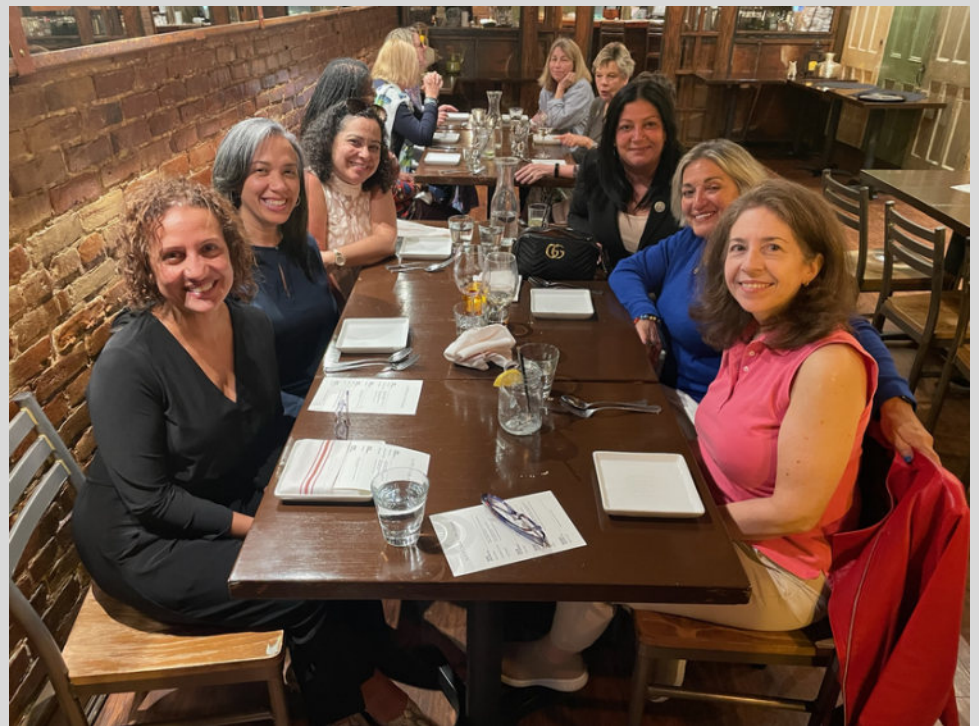
Enjoying dinner at Boca Bistro