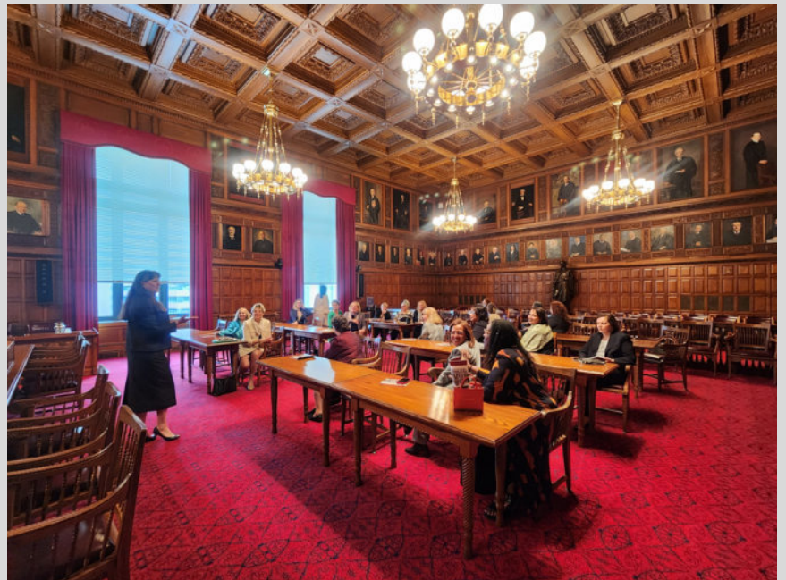
Hope Engel speaking during the Court of Appeals tour