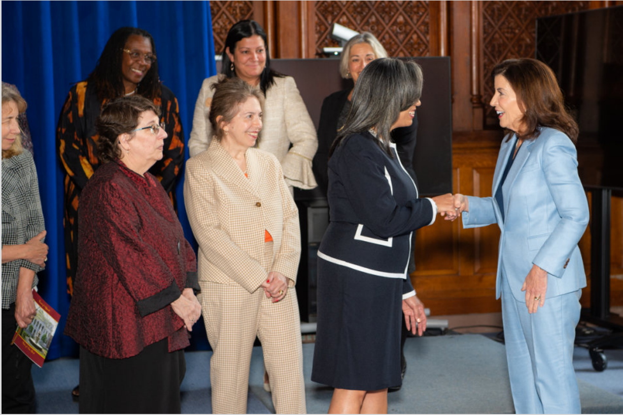
NAWJ-NY meeting with NY Governor Kathy Hochul