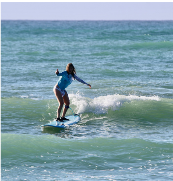
The Hon. Lisa Fisher surfing in Honolulu!