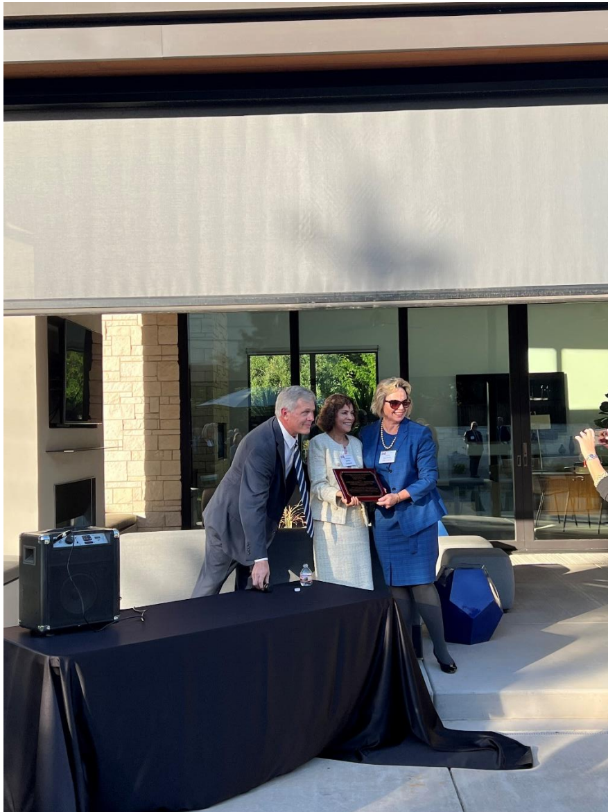
2022 ABOTA Judge of the Year Award