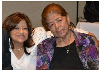
Judge Puente-Porras with her Mother