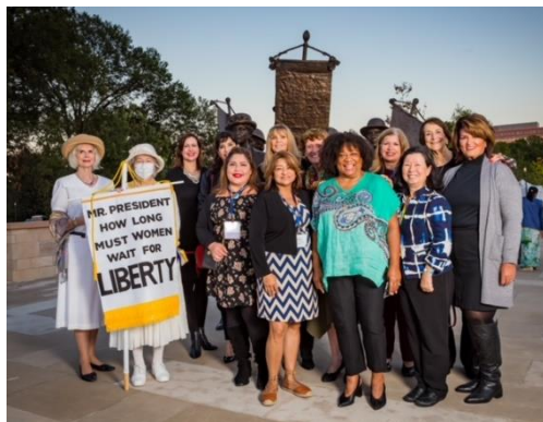
Los Angeles Judiciary was present in large numbers in Nashville.