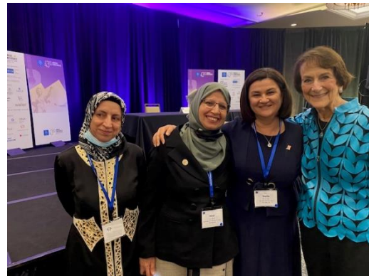
Hon. Keilani and Hon. Chirlin with two Iraqi Judges in attendance.