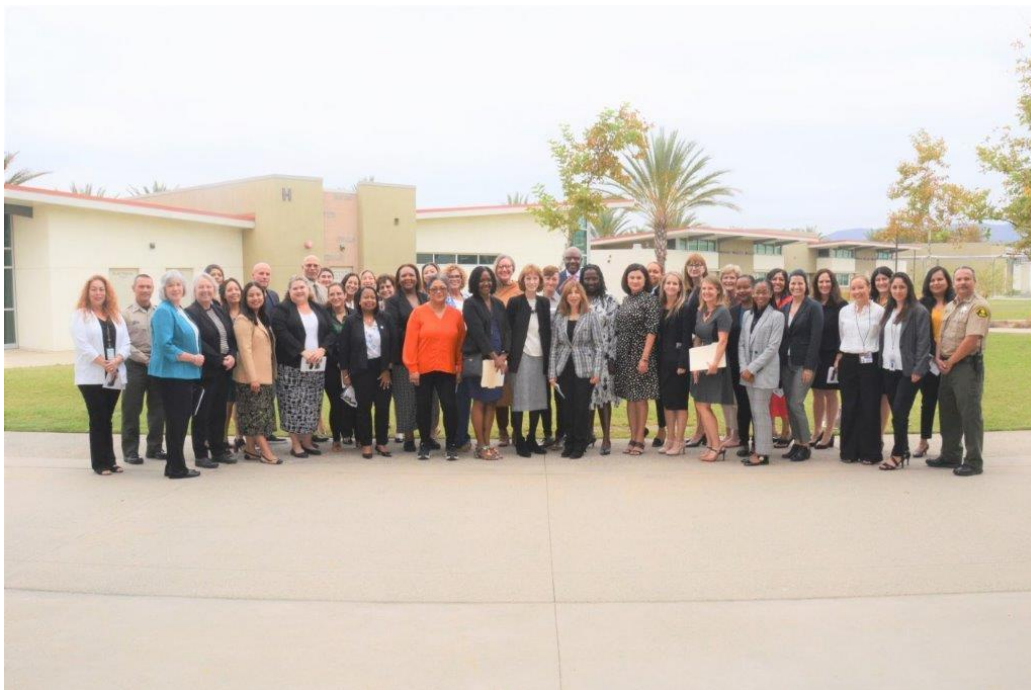
The large team who work together to make this annual event a success!