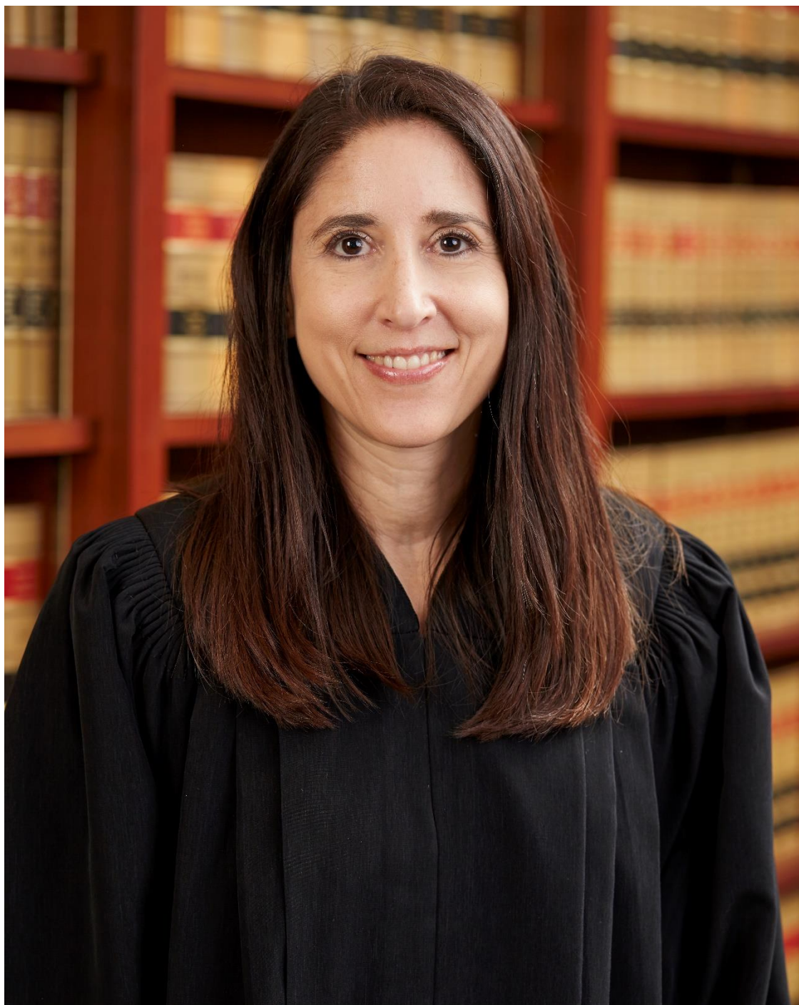
JUSTICE PATRICIA GUERRERO TAKES THE HELM AS CHIEF JUSTICE OF THE CALIFORNIA SUPREME COURT MAKING HISTORY ALONG THE WAY AS THE FIRST WOMAN LATINA LEADER OF THIS PRESTIGIOUS COURT.