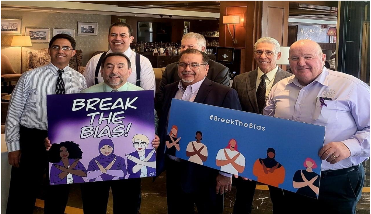
Members in Cameron County also celebrated International Women’s Day in Brownsville, Texas on March 9, 2022.