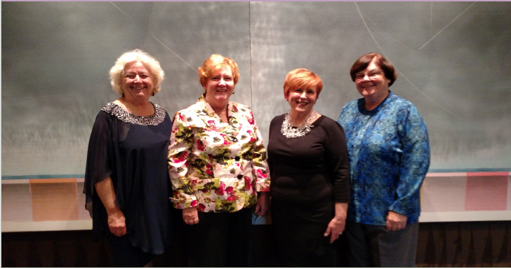
District One Judges At the Seattle Conference: (From Left)

There were visits to the Suquamish Tribal Court and Museum, the Needle, the Chihuly Glass Museum, and the Experience Music Project Museum where judges explored their musical talents and budding Rock Bands were formed.