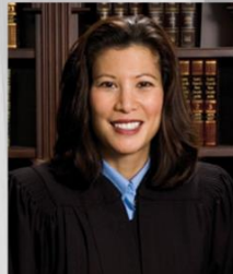
Honorable Tani Cantil-Sakauye California Supreme Court Chief Justice National Co-Chair, IVP