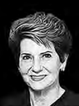
Hon. Ina Levin Gyemant (Ret.)