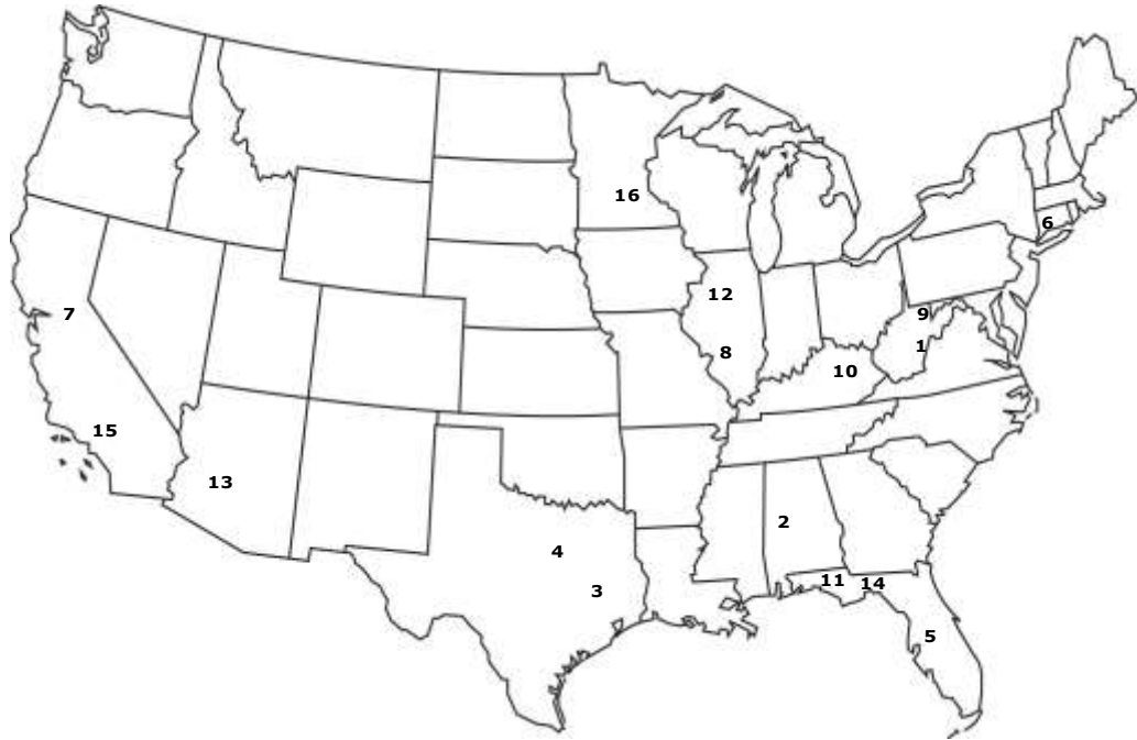
Key to the Map